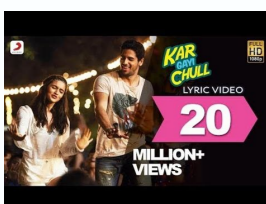
Ladki beautiful kar gayi chill dj mp3 free download. Ladki beautiful kar gayi chill remix mp3 song free download.